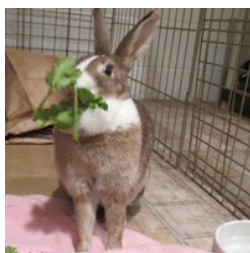
Trudy— Adopted 10/14