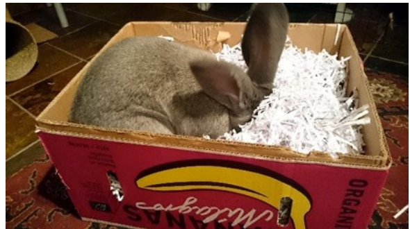
Examples (found via an internet search) of a "Diggy Box" made from a cardboard box and shredded paper.