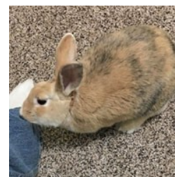
Holly— Adopted 11/24